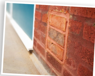
Fire stopped air vent