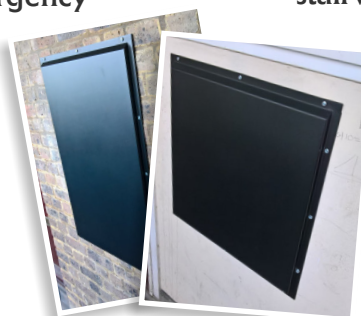
Fireproofing redundant coal hoppers