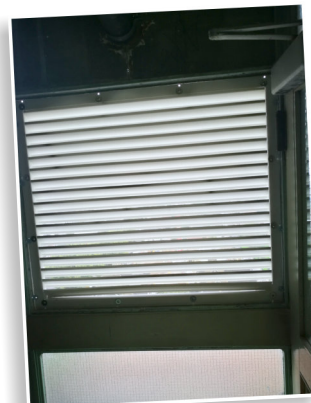
Ventilation to stairwell areas

Following this successful project the London Borough of Southwark has awarded us 80 similar blocks to complete similar works. Fire risk assessments are provided by Southwark and works are on going at a rapid pace to ensure residents' safety.